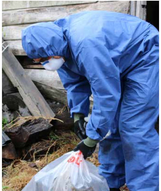
Always wear protective clothing when handling asbestos-containing materials and dispose of immediately afterwards

PPE is commercially available at construction suppliers, safety equipment retailers and some hardware chains.